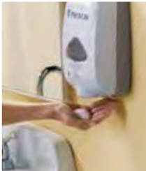
Soaps and Hand Care