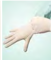
Gloves and PPE