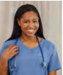
Uniforms and Workwear

Ask your UniFirst representative about other specialized healthcare services and facility service products.