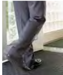
Floor Mats and Mops