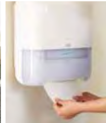
Paper and Tissue Products